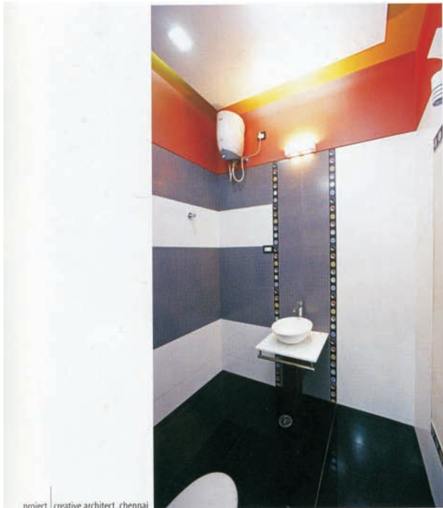
project | creative architect, chennai