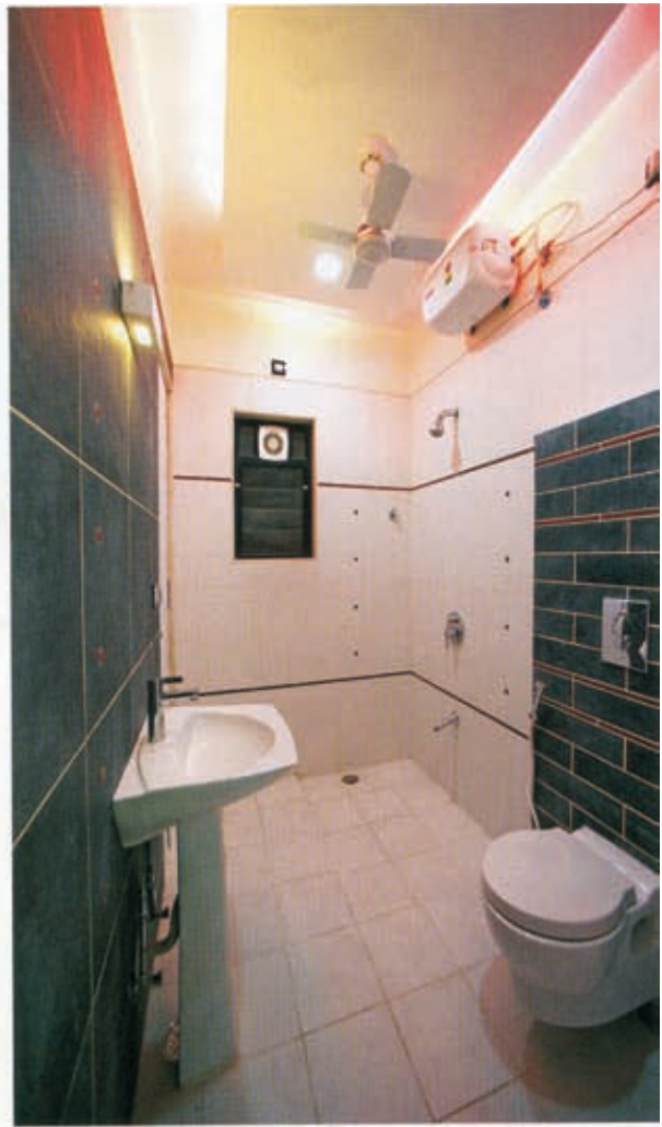
project | creative architect, chennai