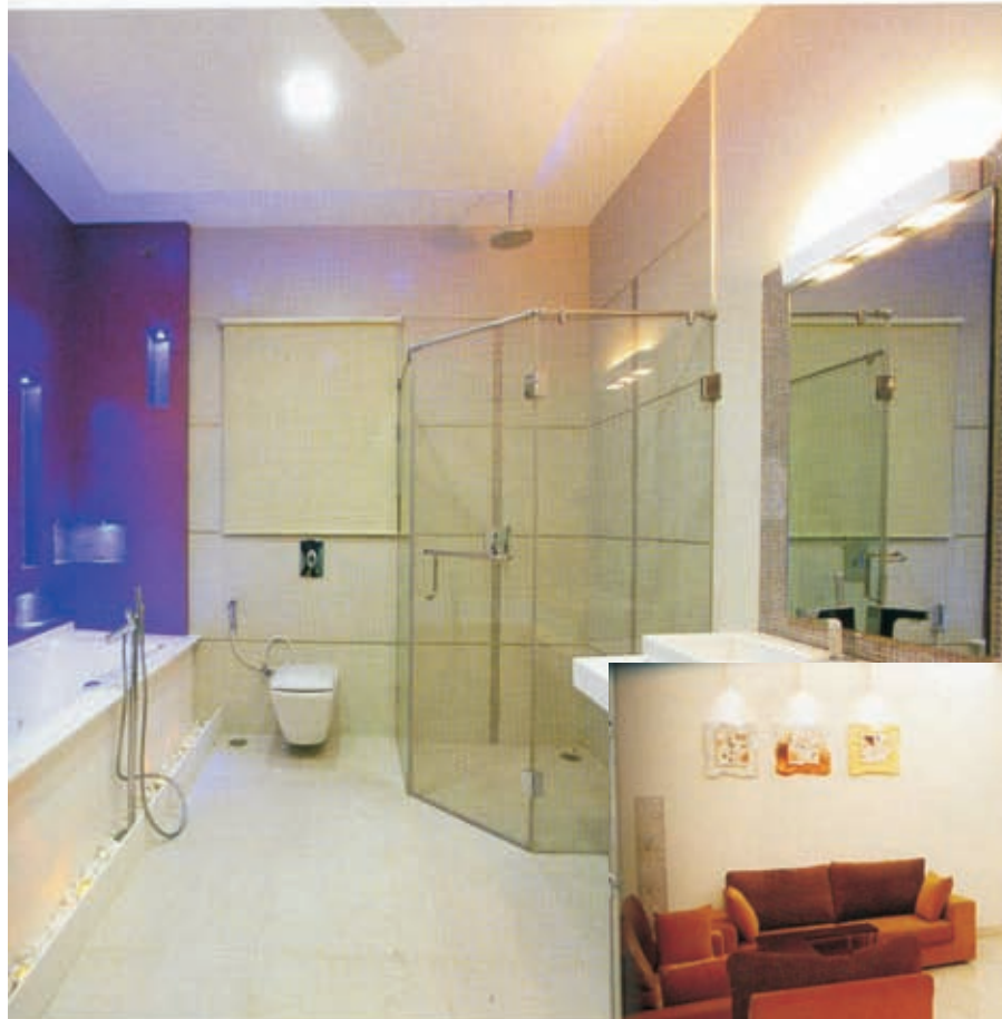
project | creative architect, chennai