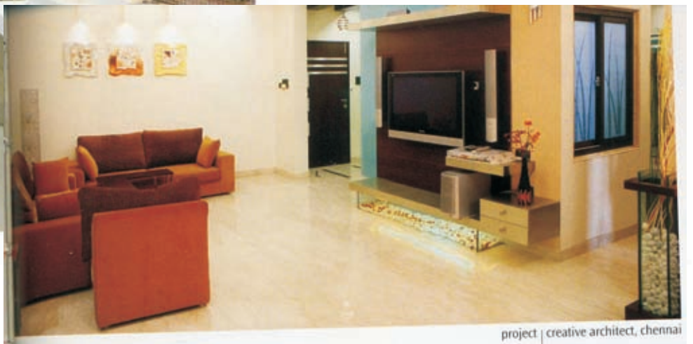
project | creative architect, chennai